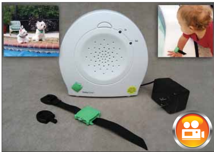
The Safety Turtle alarm kit from Terrapin Communications.